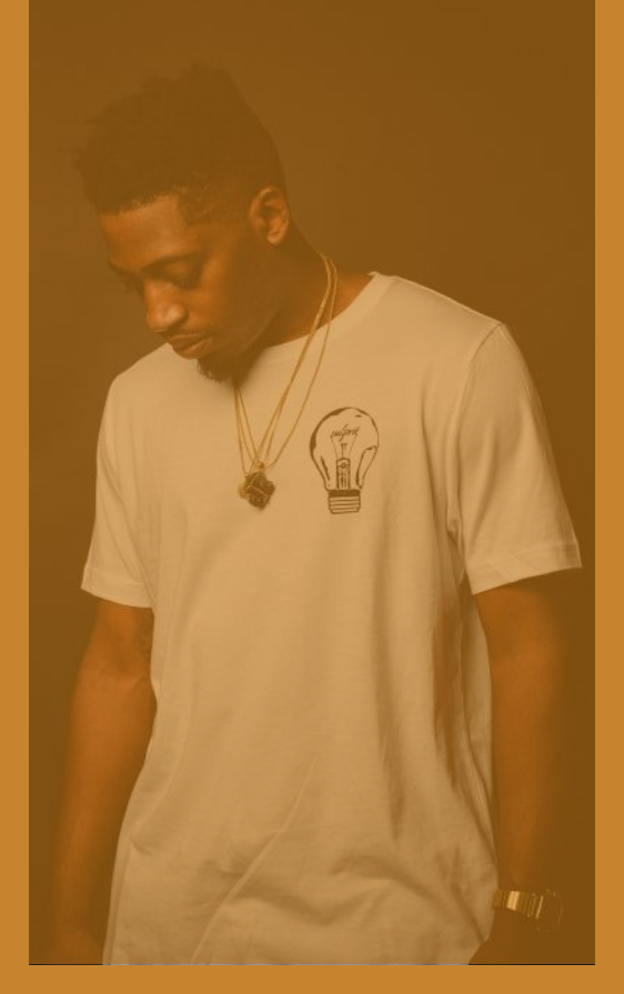
Asia Link Design